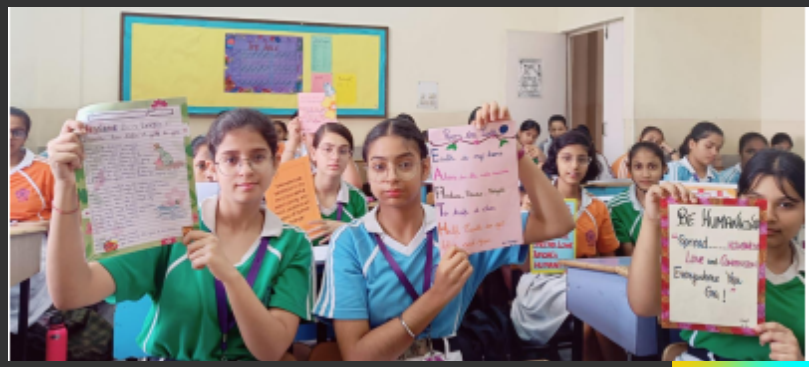
Class IX & X: -Poetry Writing