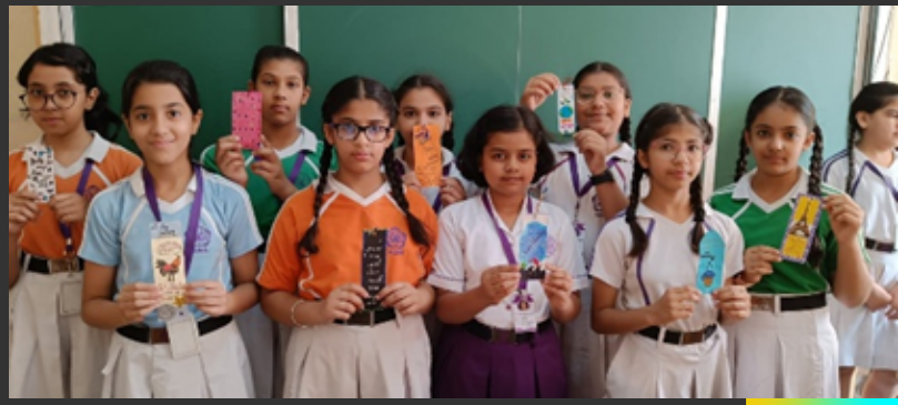
Class VI : Book Mark Making