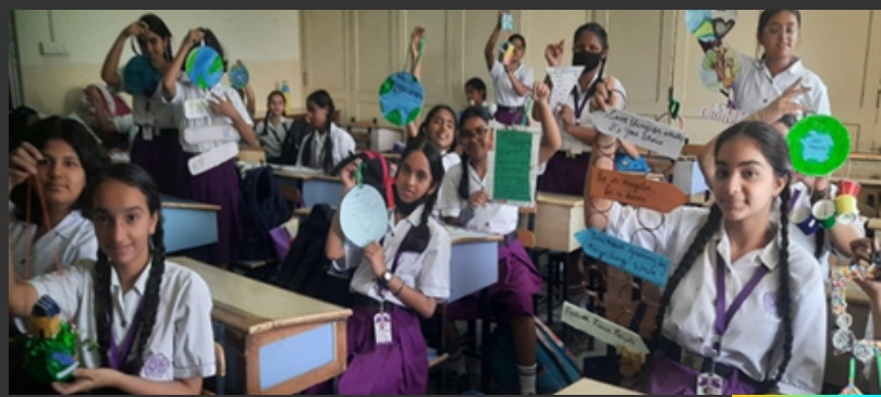
Class VIII : Wall Hanging Making