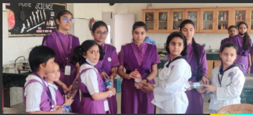
Plastic Bottle collection for RVM