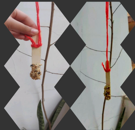
Class VII : Bird Feeder Sticks